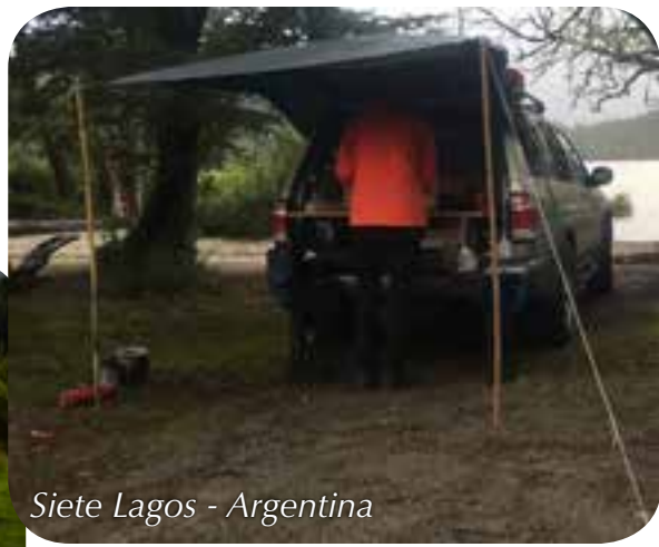
Siete Lagos - Argentina