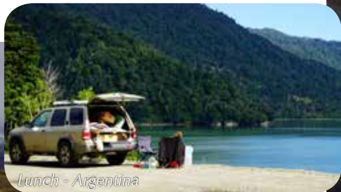
Lunch - Argentina