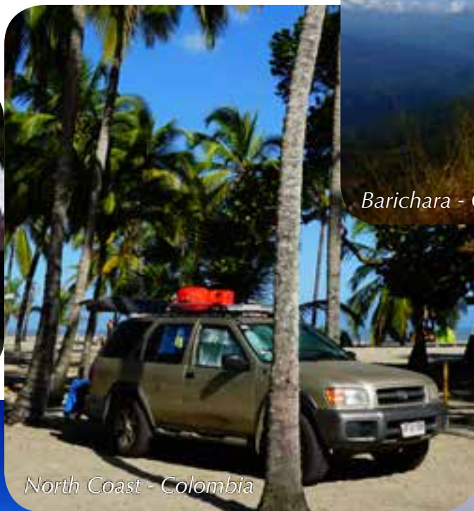
North Coast - Colombia