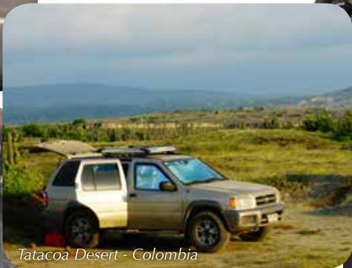
Tatacoa Desert - Colombia