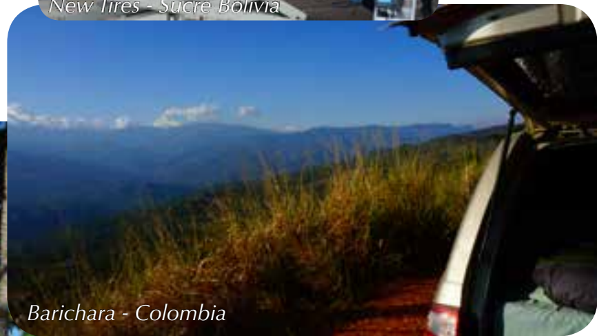
Barichara - Colombia