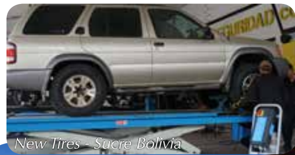
New Tires - Sucre Bolivia