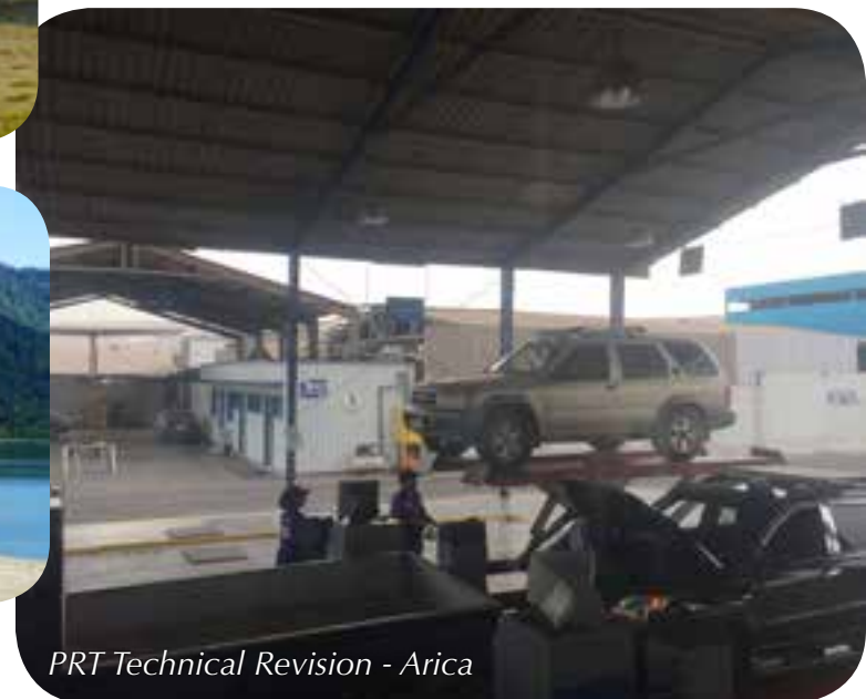
PRT Technical Revision - Arica