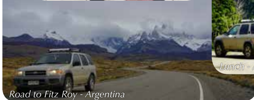
Road to Fitz Roy - Argentina