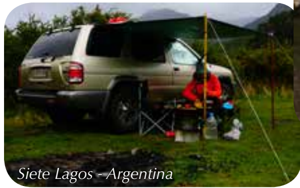
Siete Lagos - Argentina