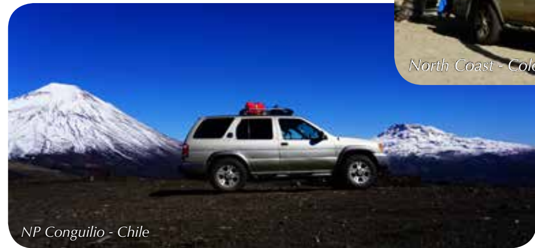
NP Conguilio - Chile