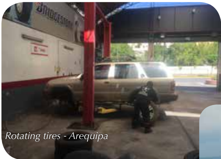
Rotating tires - Arequipa