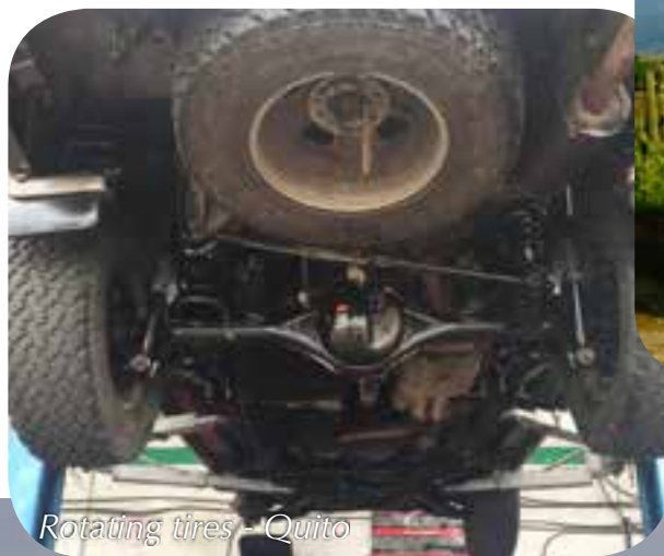
Rotating tires - Quito