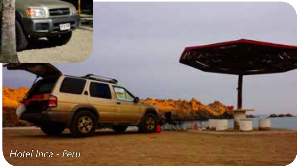
Hotel Inca - Peru