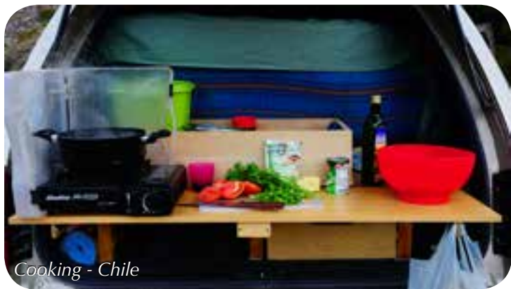
Cooking - Chile